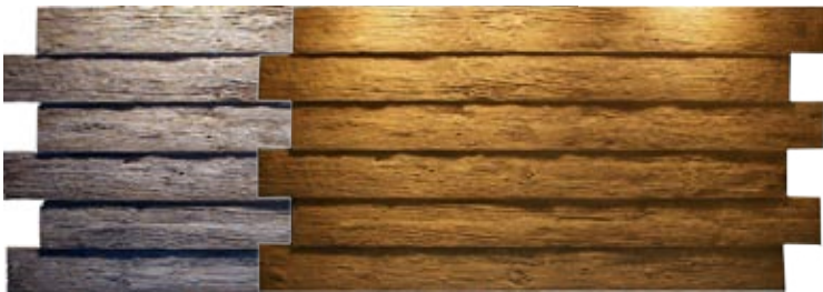
DP 2420 - 4'x 8'