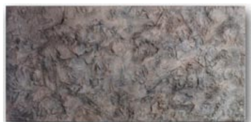
DP 2435 - 4'x 8'