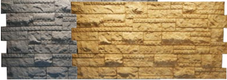
DP 2450 - outside width: 96" inside width: 89 1/2" h: 48 3/8"