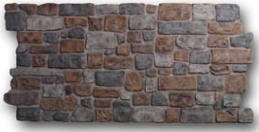
DP 2410 - 4'x 8'