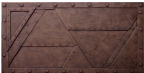
DP 2430 - 4'x 8'