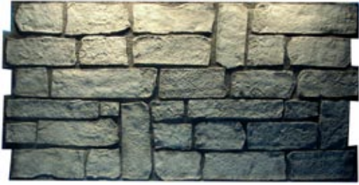
DP 2440 - outside width: 97 3/8" inside width: 92 1/2" h: 49 1/2"