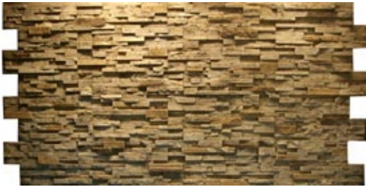
DP 2460 - outside width: 96" inside width: 88 1/4" h: 48 1/4"