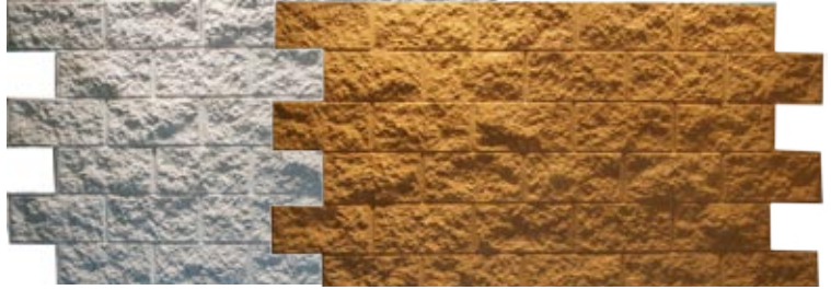
DP 2445 - outside width: 88 1/4" inside width: 72" h: 48 1/4"