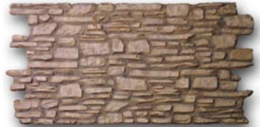
DP 2405 - 4'x 8'