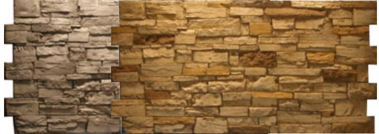
DP 2455 - outside width: 95 1/2" inside width: 89 1/4" h: 48 1/2"