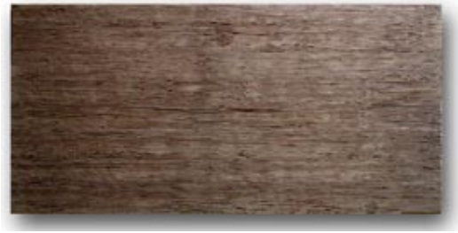
DP 2425 - 4'x 8'