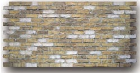
DP 2400 - 4'x 8'